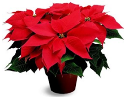
Nchang Azefor Covid-10 Victims