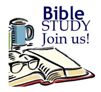
Tuesdays after the 11:00am Mass in the Parish Center