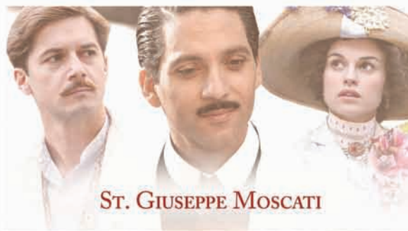
ST. GIUSEPPE MOSCATI

The inspiring true story of the holy Franciscan priest and theologian who won a famous debate against the Dominicans in the thirteenth century, in which he defended Our Lady's great privilege of her Immaculate Conception. Filmed in beautiful ancient monastery locations in Europe, Scotus is revealed as a humble and courageous apostle of the Faith against the oppressive anti-Catholic government in power.