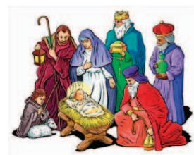
THE HOLY FAMILY OF JESUS, MARY, AND JOSEPH

Saturday, December 25 4:15 - 5:15 Confessions