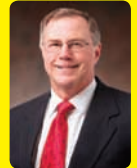
Notre Dame Graduate

Mobile: 301-512-1155 Office: 202-338-8900 TMCGLYNN88@GMAIL.COM