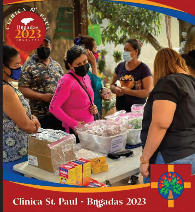
Clinica St. Paul - Bngadas 2023