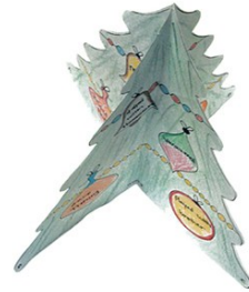
Different angles of completed tree.