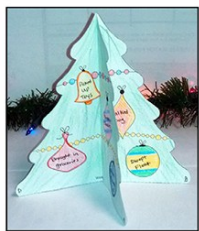
Weeks 1 & 2 together.