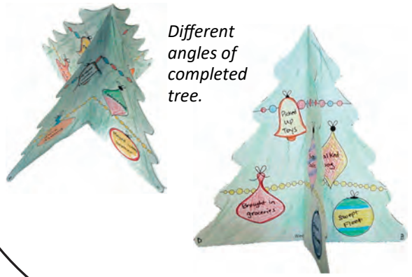
Different angles of completed tree.

Color tree and fill in good deeds, then color ornaments and cut out.