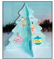
Weeks 1 & 2 together.